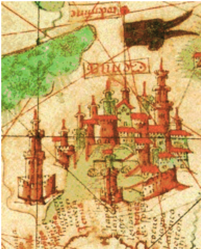
Figure 1: Vignette of Genoa from the Jehuda Ben Zara chart of 1497. Note the four-tiered lighthouse on the bottom left of the city on a promontory.