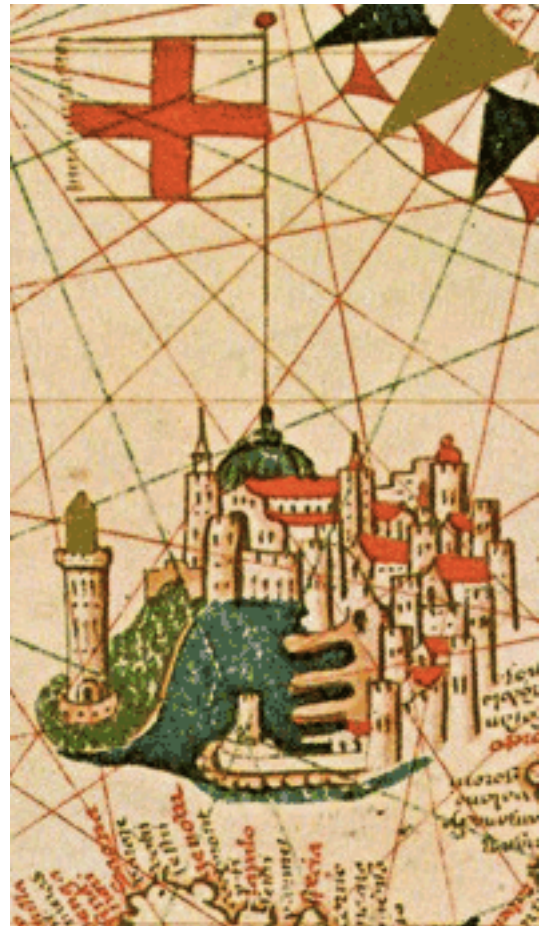
Figure 2: Vignette of Genoa from the Mateo Prunes chart of 1563.

The Joan Martines atlas of 1570 shows the lighthouse of Barcelona atop the hill of Montjuïc (Figure 3) and the Jacobus Russus chart of 1563 does the same (Figure 4). Unfortunately on most portolans these vignettes are rare or non-existent, most are generalised, and not accurate depictions of the port itself.